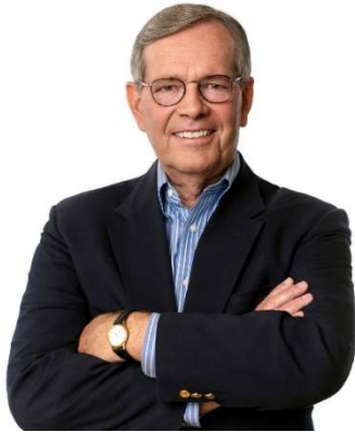
GOVERNOR MICHAEL LEAVITT, CO-CHAIR