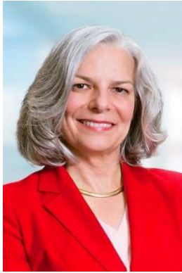
JULIE GERBERDING, M.D., M.P.H.

Dr. Gerberding is EVP/Chief Patient Officer for Merck and a world-renowned public health expert. Prior to joining Merck, she served as the Director of the CDC from 2002-2009. While at the agency, she led more than 40 emergency responses against crises such as anthrax, SARS, bird flu, food-borne outbreaks, and natural disasters. Previously, Dr. Gerberding was a tenured faculty member in Infectious Diseases at the University of California at San Francisco (UCSF). She continues as an Adjunct Associate Clinical Professor of Medicine at UCSF.