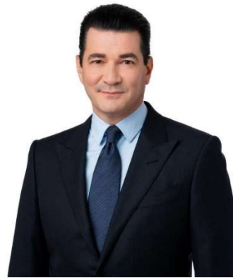
DR. SCOTT GOTTLIEB, CO-CHAIR

Former Secretary of Health and Human Services